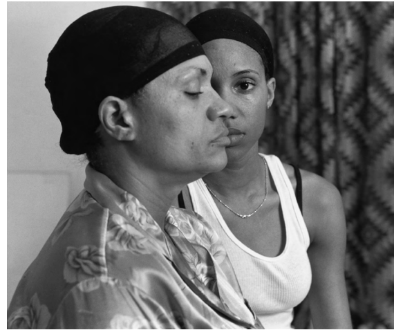
LaToya Ruby Frazier, Mom and Me , from the series The Notion of Family , 2008