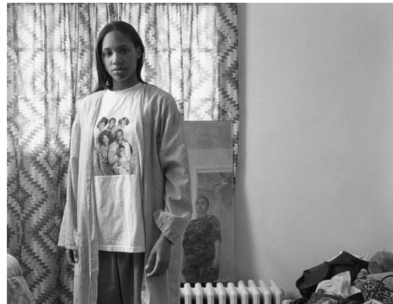
LaToya Ruby Frazier, Huxtables, Mom, and Me , from the series The Notion of Family , 2008