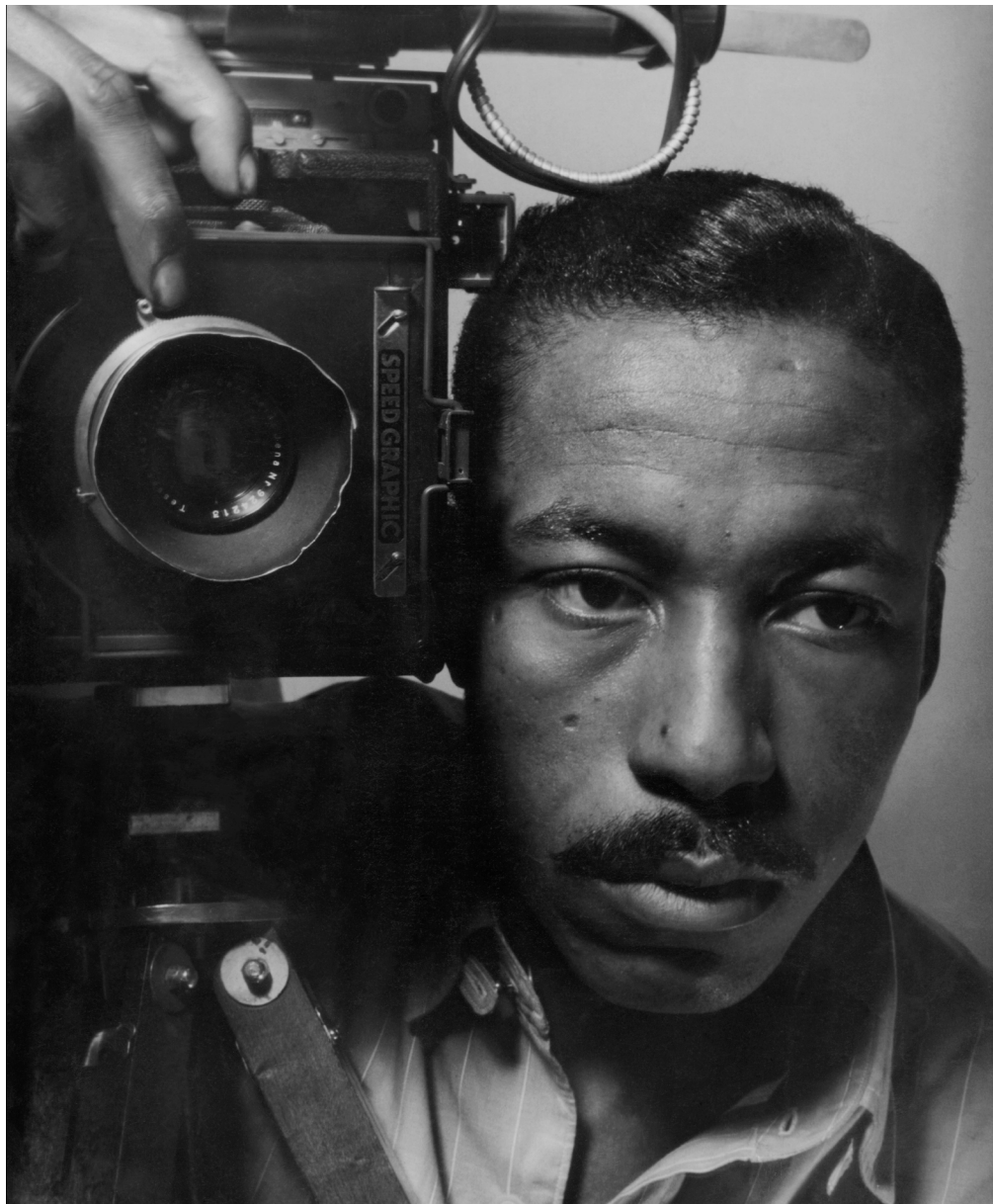
Gordon Parks, Untitled , 1941