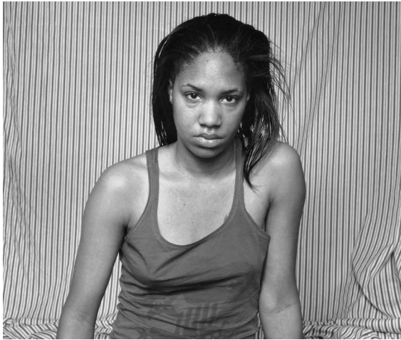
LaToya Ruby Frazier, Self-Portrait , from the series The Notion of Family , 2009

A Choice of Weapons: Inspired by Gordon Parks features several self-portraits taken by LaToya Ruby Frazier in her series The Notion of Family . Observe these images and their captions closely and use the discussion questions below.