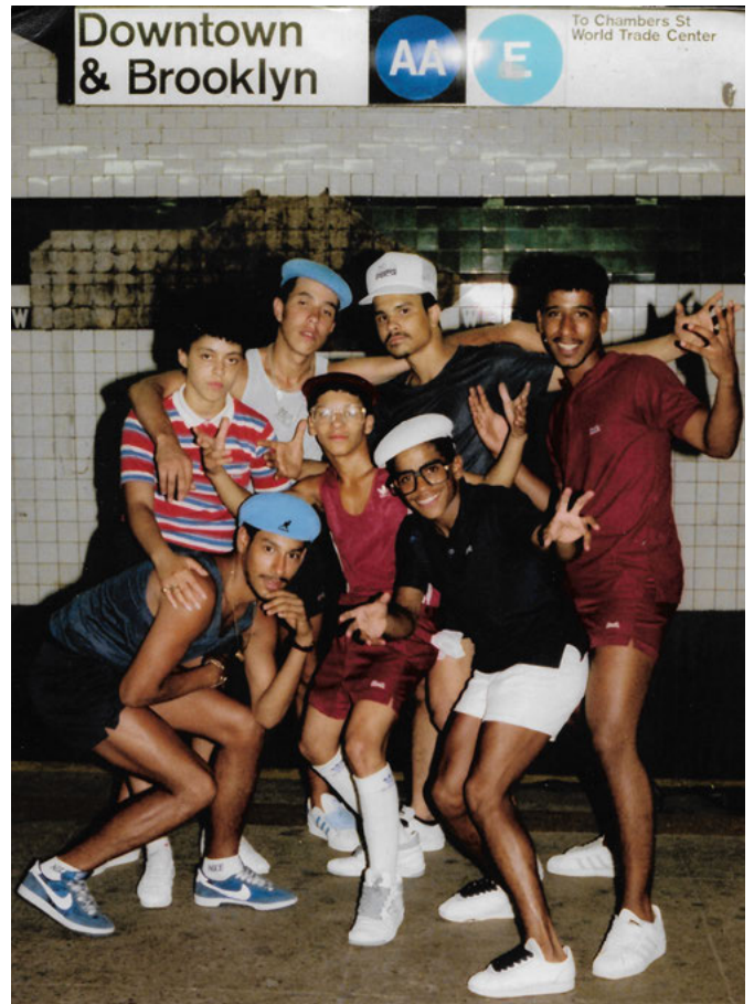
Jamel Shabazz, Summer in the City with the XMEN , c. 1980