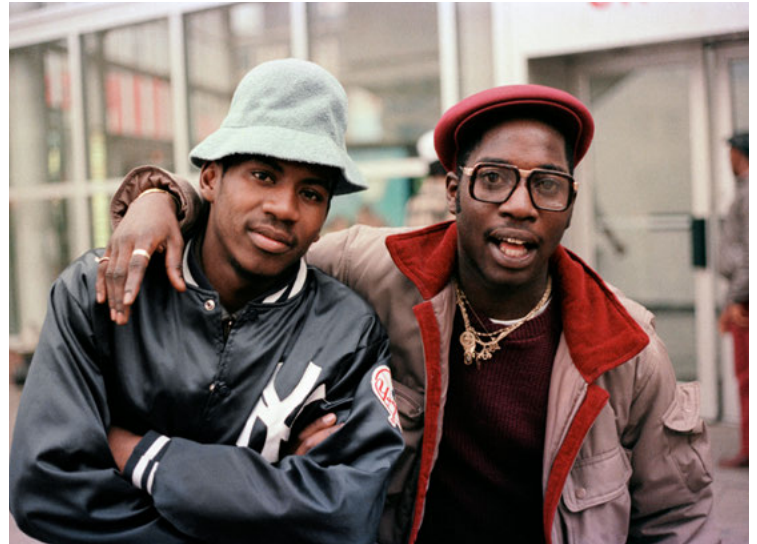
Rolling Partners, Downtown, Brooklyn, 1982