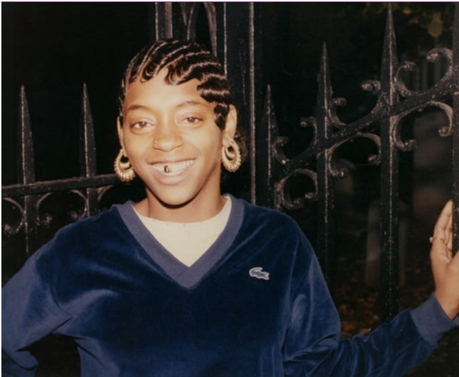
Jamel Shabazz, Brooklyn , 1983