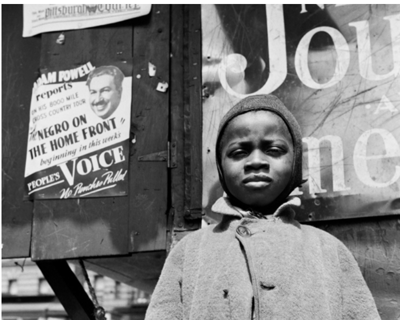
Gordon Parks, Untitled , Harlem, New York, 1943