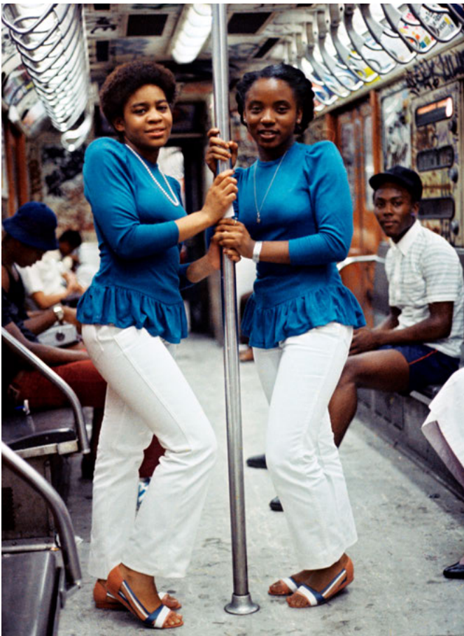
Jamel Shabazz, Soros for Life , Soros for Life , Crown Heights, Brooklyn, NYC, 1981