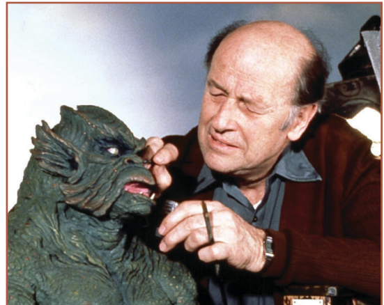
Photos: Producer Shonda Rhimes arrives for the 2016 the White House Correspondents’ Association annual dinner at the Washington Hilton hotel in Washington, DC, April 30, 2016. lower left ; “Clash of the Titans” Ray Harryhausen. lower right