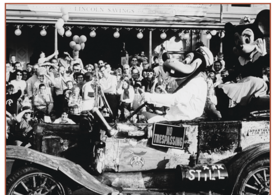
Photos: Producer Abigail Disney arrives at the 7th Annual Tribeca Film Festival - Pray the Devil Back to Hell Premiere at the AMC Village 7 Theater on April 24, 2008 in New York City. top; Roy E. Disney with a storyboard for Oliver & Company behind him. lower left; Parade in Disneyland park. lower right