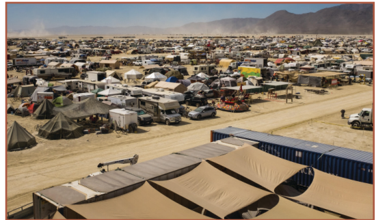
Photos: Chip with mom and sister when he was a toddler. (Chip Conley) top left ; Chip as a young adult shaking hands in front of car. (Chip Conley) top left ; Promotional image, Phoenix Hotel. (Chip Conley) lower left ; A view across the dust covered camps at Burning Man. (2checkingout) lower right