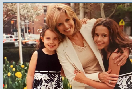
Photos: Katie Couric as a child in her living room. left