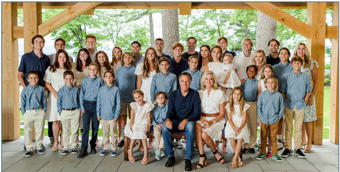
Photos: Mitt Romney in the 1965 edition of the Brook yearbook produced by Cranbrook School. top; Mitt Romney and family portrait with all of his kids and grandkids. lower