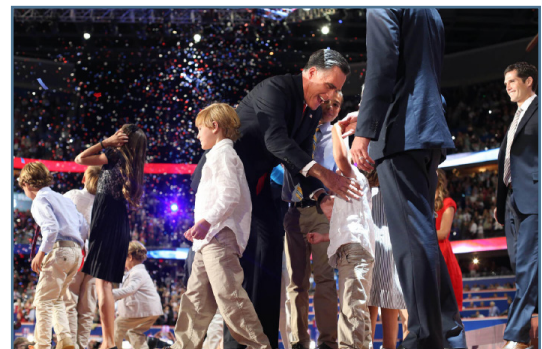
Photos: Republican Presidential hopeful former Massachusetts Governor Mitt Romney and his wife Ann address supporters at a campaign stop in West Des Moines Iowa on Jan 3 2008. left ; Mitt Romney greets family at the conclusion of the 2012 Republican National Convention at the Tampa Bay Times Forum in Tampa. Thursday, Aug 29, 2012. right