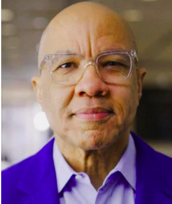
Darren Walker, President, Ford Foundation