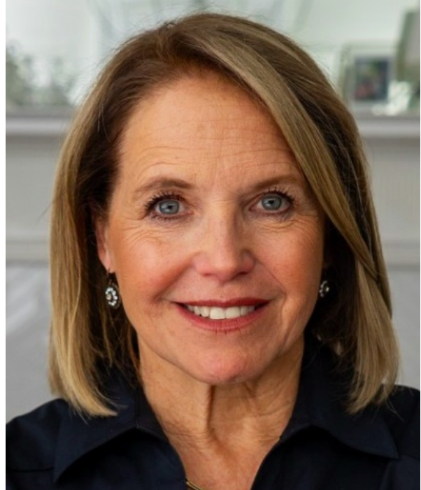
Katie Couric, Journalist