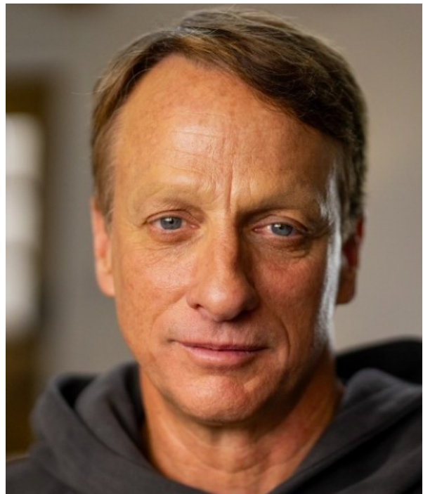
Tony Hawk, Professional Skateboarder & Entrepreneur