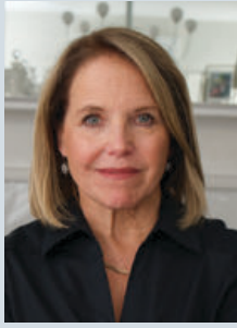
Katie Couric Journalist