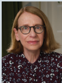
Roz Chast Cartoonist