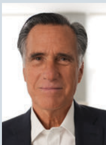
Mitt Romney Politician