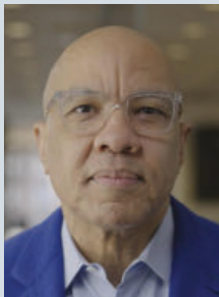
Darren Walker President, Ford Foundation