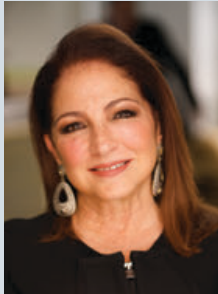
Gloria Estefan Singer