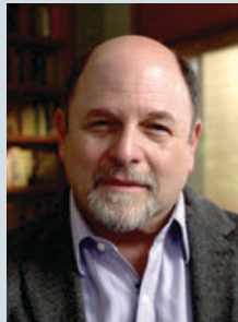
Jason Alexander Actor

Note: All five social and emotional competencies identified by CASEL are woven throughout the series.