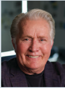
Martin Sheen Actor