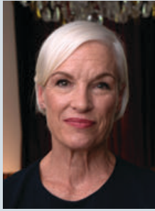
Cecile Richards Former President, Planned Parenthood